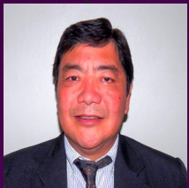
PDS Abo Gempesaw